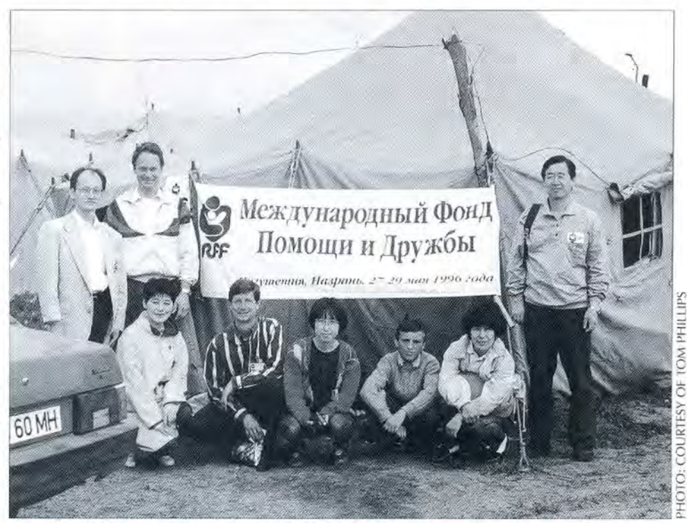
Two local doctors and one pharmacist joined the IRFF team from Japan and the CIS.

Another team built a volleyball court at the camp and played volleyball with the young people. Many of the children have not been to school for two years, and many of the younger children could not speak Russian. The opportunity to