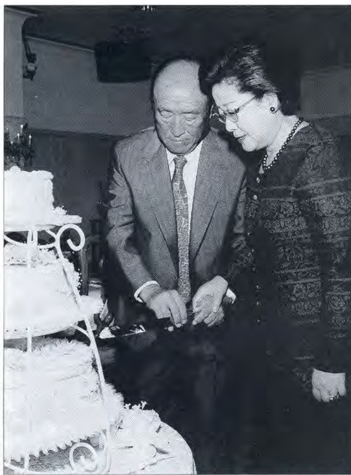
True Parents cut the cake at the celebration of their 36th Wedding Anniversary. East Garden, May 3, 1996.