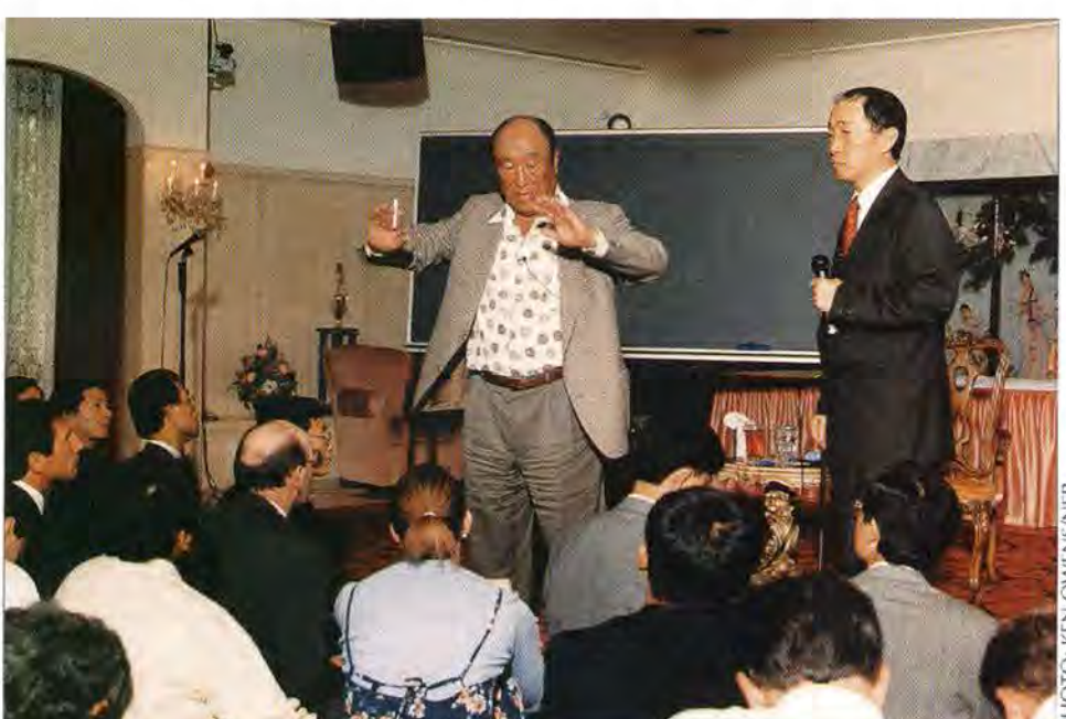
Father gives witnessing strategies to the leaders at East Garden. May 1, 1996.

This point in my account is a suitable point to discuss the whole issue of spiritual children in countries like Egypt. In America, one would witness and teach until someone "saw the light" and joined. In Egypt, you would witness and teach until someone became a friend. It seemed almost impossible to communicate the urgency and importance of True Parents and this providence. Christians and Muslims there are surprisingly similar to each other, although both would deny this adamantly. The minority status of Chris-