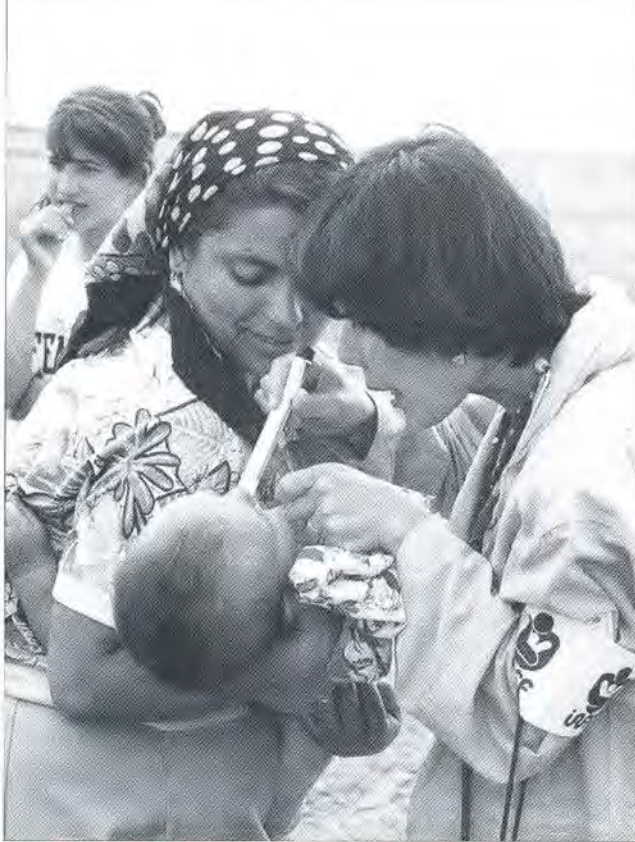
Children suffer the most from refugee life.

play sports and make friends with people from other countries and share about their troubles helped them to begin to deal with their feelings about the war. There is a lot of resentment among the Chechenian refugees towards Russians. And many Russians hold a stereotype of Chechenians as being criminals and con-